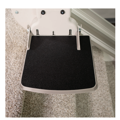
Not all options are shown.