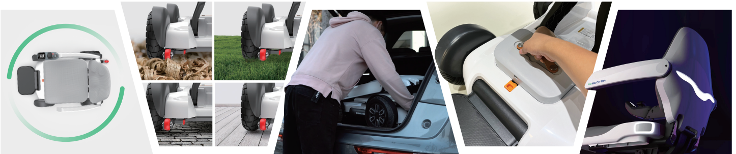
Tight turning radius