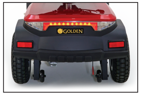
Ultrabright LED rear lights.