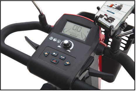
Integrated LCD console display monitors speed, odometer, fault codes & battery life.