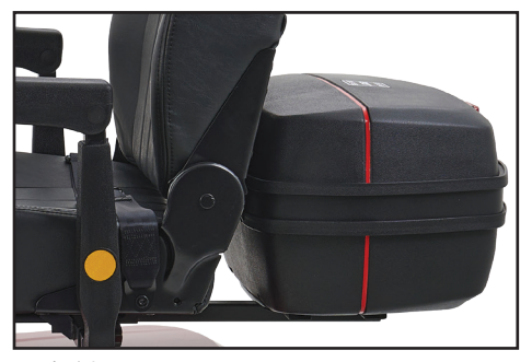
Lockable water-resistant storage compartment comes standard and attaches to the accessory bracket.