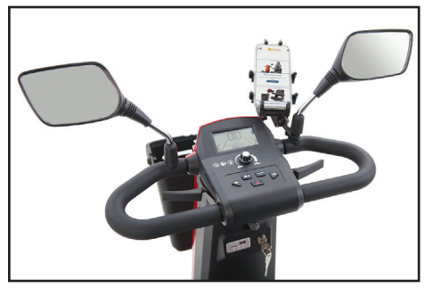
Rear view mirrors, cell phone holder and built-in speaker system with Bluetooth® & USB connectivity.