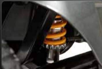
Pride's CTS Suspension

Exclusive stylish, lightweight, non-scutting, black, low-profile tires (Optional pneumatic tire on the 4W: S67)