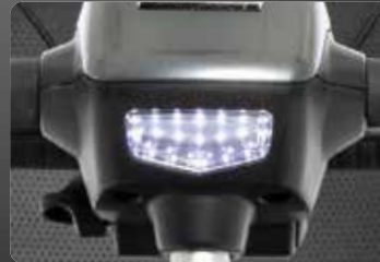
LED headlight in tiller

Experience the Revo® 2.0 , the most impressive mid-size scooter that combines an array of features into one great package. Tough and built to last, the Revo 2.0 offers rugged dependability you expect from luxury mid-size scooters. Comfort-Trac Suspension (CTS) ensures a smooth and comfortable ride over varied terrain. Experience convenient, feather-touch disassembly for portability that is comparable to our Travel Mobility line. Enjoy standard under seat storage and speeds up to 5.2 mph (8.4 km/h).