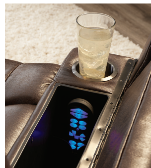
Right Arm: Cup Holder & Storage Compartment

The Rhea comes standard with the following comfort and convenience features: