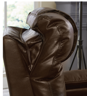
Adjustable Headrest & Lumbar